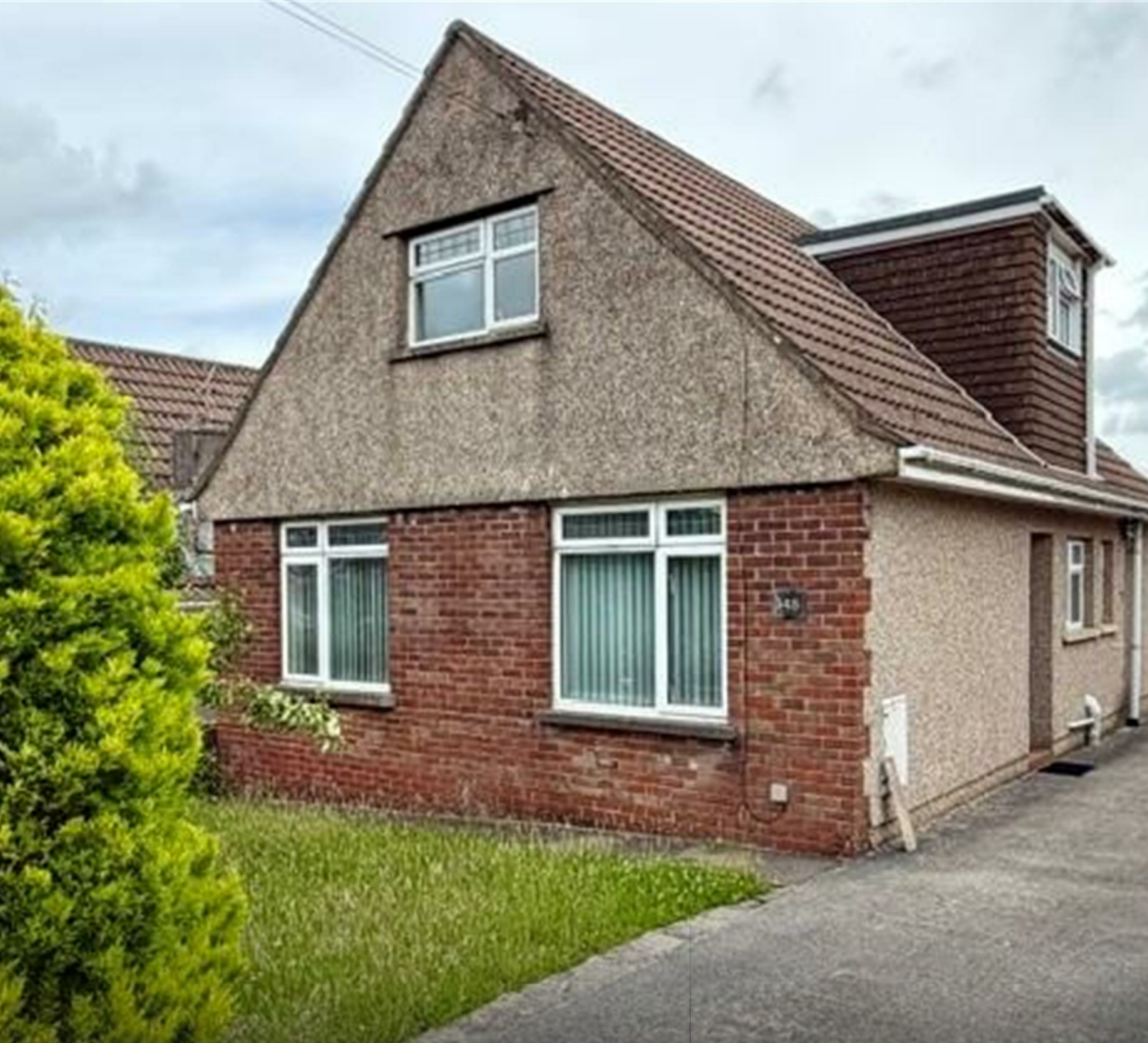
145, Heol Y Bardd Bridgend, CF31 4TD